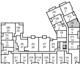
Levels 6 - 7